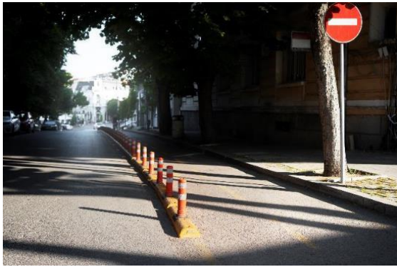
Figure 5. Visual Bollard Object

The second visual object used is a bollard. A bollard is a barrier typically placed along sidewalks to prevent motorists from entering the pedestrian path. This object was chosen as an additional element to further enhance the visual appeal of the design.