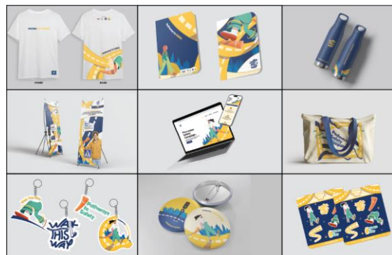
Figure 14 Supporting Media