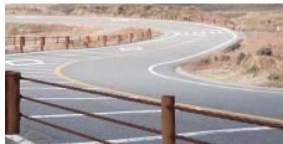
Figure 4 Visual Objects of the Road

In designing this campaign, the author chose the visual object "road" where this object was chosen to represent the purpose of this design, namely to invite and educate the public to follow the tips that must be considered when they are on the highway/public facilities.