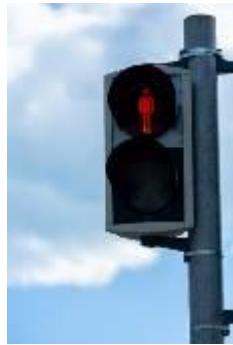
Figure 6 Visual Object of Crossing Lights

The second visual object used is a bollard. A bollard is a barrier typically placed along sidewalks to prevent motorists from entering the pedestrian path. This object was chosen as an additional element to further enhance the visual appeal of the design.