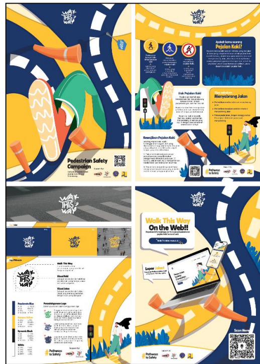
Figure 12 Media Issue Poster

and also Sticker packs. These media have received the Final design, namely as follows: