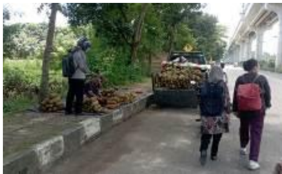
Figure 2. Pedestrian of facilities taken over by traders