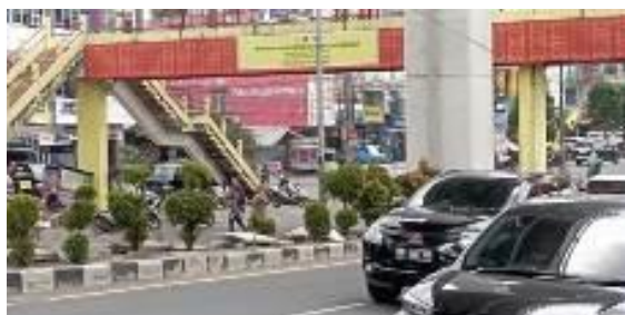
Figure 3. People do not utilize the JPO facilities