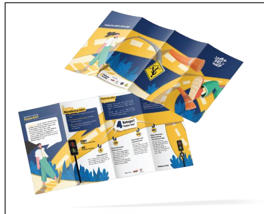
Figure 13 Media Issue Brochure