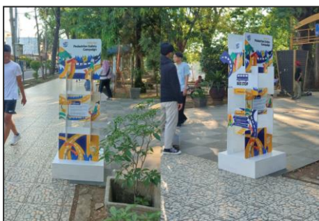
Figure 11 Main Media Safety sign

The primary media for this design is a "safety sign," a combination of a signage and an education board. This media serves to educate the public about what to pay attention to when walking in pedestrian areas.