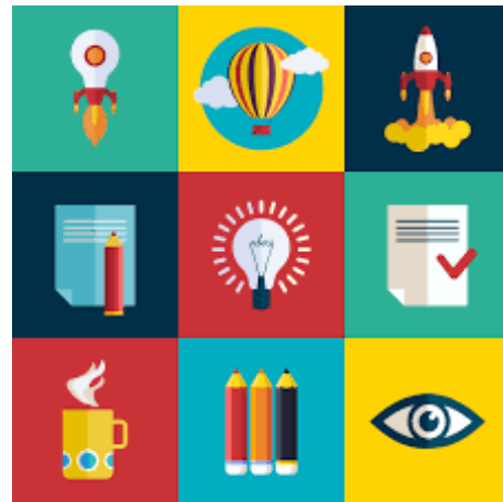
Figure 9 Flat Design

This visual communication design, addressing the importance of public facilities for pedestrian safety in Palembang, utilizes flat design, a minimalist design approach. Flat design, which became extremely popular in the design industry in 2013, has significantly influenced designers in their work. This style draws its roots from various sources, including the Swiss Style, or International Design, which was dominant throughout the 1940s and 1950s and originated in Switzerland [18].