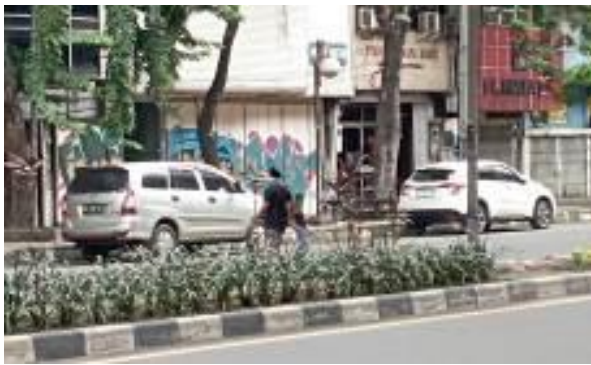
Figure 1. People crossing without using facilities